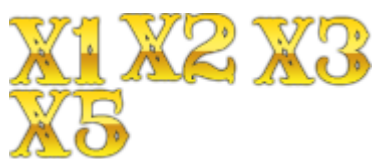
Avalanche multipliers in the main game

The Wild symbol changes its look to mimic whichever symbol it is replacing on the winning bet line.