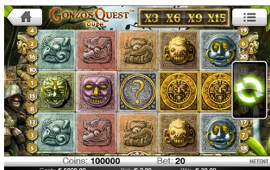
Wild symbol substitutes for any symbol