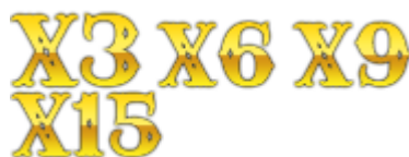
Avalanche multipliers in the Free Spins