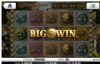
Big win presentation