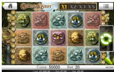
Main game area