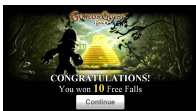
Free Fall win presentation

There is no limit to the number of Avalanches a player may experience in a game round; however the maximum multiplier is 5 in the main game and 15 in the Free Fall feature.